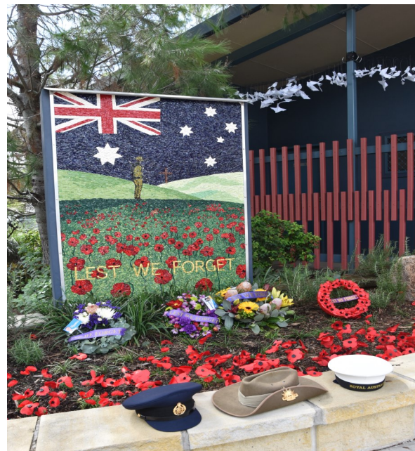
Our tribute to past and present ADF members.

Advise the office and let the DSM know so they can arrange a farewell pack for students.